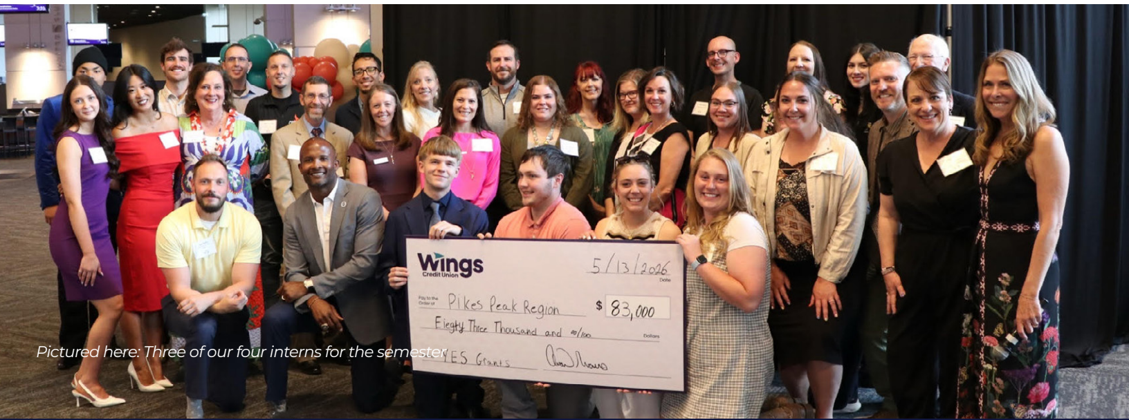
Pictured here: Three of our four interns for the semester

2335 Robinson Street, Colorado Springs, CO 80904 719-636-2460 safepassagecac.org