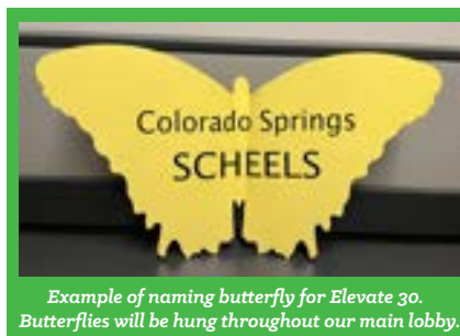
Example of naming butterfly for Elevate 30. Butterflies will be hung throughout our main lobby.

In honor of our 30th anniversary, we are looking for businesses to stand with us to inspire hope and healing for every child in El Paso and Teller counties that have experienced abuse. With a gift of $1,000 or more, you will receive a naming opportunity in our main lobby on a butterfly and recognition as a top business is Colorado Springs supporting the health and safety of kids in our community!