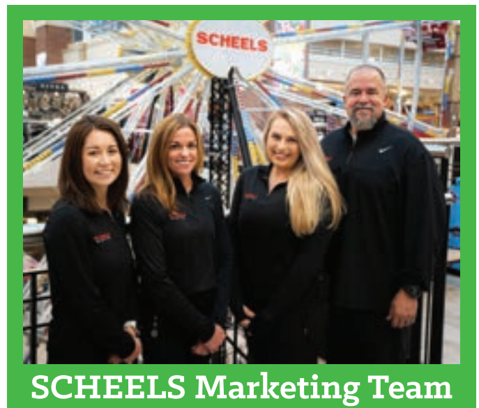
SCHEELS Marketing Team

"To understand how many children are affected by child abuse in your community! Safe Passage gives children a voice and a safe way to heal from such trauma. This organization is making huge strides and giving kids in our community the resources that they need."