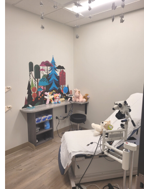
Medical Exam Room